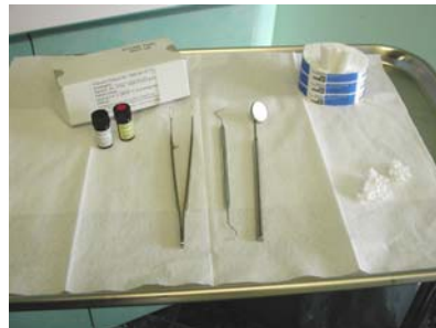
Figure 2: Tray set up for Stage

Step #1. Preparation: Ensure that the dentition contains no open caries lesions or restorations with imperfect margins. Prepare for the application with a tray (Figure 2), consisting of cotton rolls, cotton pellets or fine brushes, forceps, air syringe, and a vial of Stage 1 chlorhexidine coating and a vial of Stage 2 sealant coating.