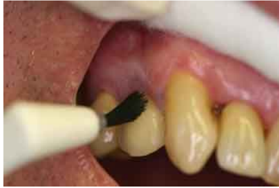
Figure 3: Apply Prevora Stage 1 chlorhexidine coating with a fine brush to the gingival margin, followed by Prevora Stage 2 sealant coating using the same techniques.

Step #7. Apply Stage 1 chlorhexidine coating to other tooth surfaces: Apply this coating to all other tooth surfaces (Figure 3) in this same quadrant, and then air dry. Be careful to avoid applying Stage 1 chlorhexidine coating to the soft tissues as the patient may experience stinging or burning of the gums or tongue.